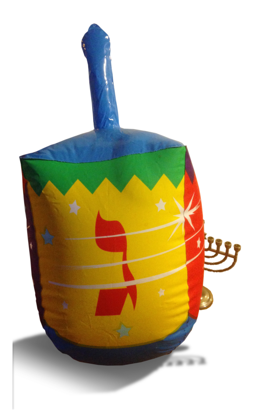
Be gelty, gelty, gelty with a beach ball-like inflatable dreidel, this week's second prize.

The Style Conversational: The Empress's weekly online column discusses each new contest and set of results. Especially if you plan to enter, check it out at wapo.st/styleconv.